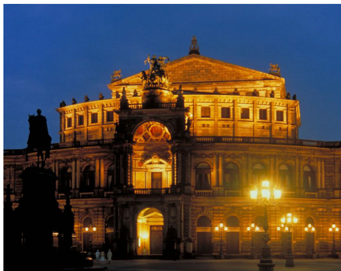
Semper Opera, Dresden

Our introduction to the historic center of Leipzig takes us among other places to the old town hall, Auerbachs Keller made famous by Goethe in Faust and, in the afternoon, the superb Bach Museum. Lunch is nearby. Your evening is free.