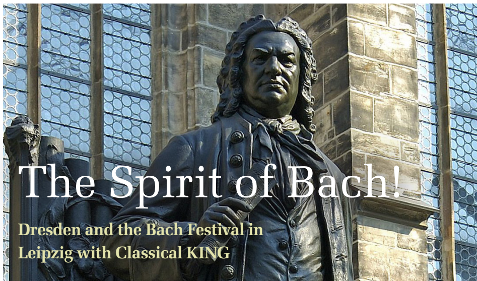
Bach statue, Leipzig