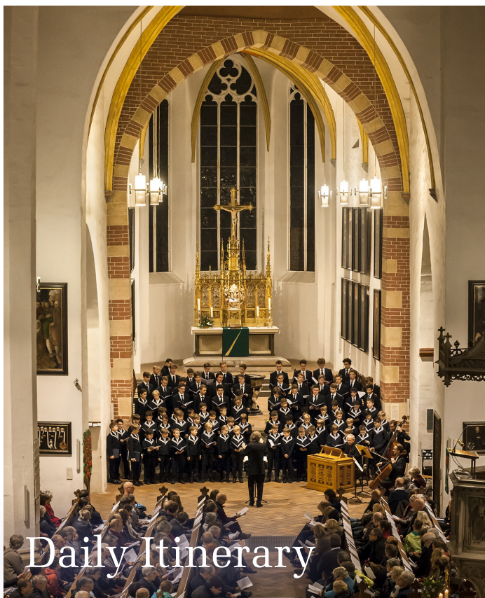
St. Thomas Church, Leipzig