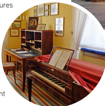
Mendelssohn House, Leipzig