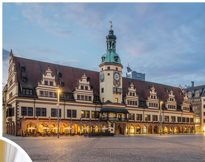
Market Square, Leipzig

Your morning and early afternoon in Leipzig is free before a gala final evening. The outstanding Amsterdam Baroque under the baton of the eminent baroque specialist and current president of the Bach-Archive, Ton Koopman, concludes the Bach Festival with the composer's great B-Minor Mass at the Thomaskirche. Our Farewell Dinner is at one of Leipzig's finest restaurants nearby.